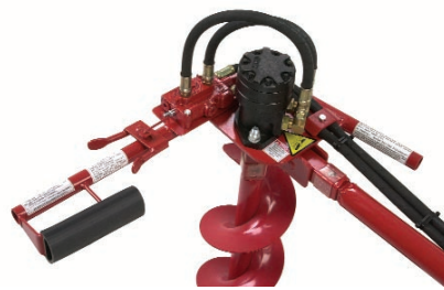
The one-man handle is used for ordinary drilling tasks. The 150 RPM motor generates 225 ft. lbs. of torque to drive augers up to 9" in diameter. An optional 220 RPM motor is available when higher speeds are desired.