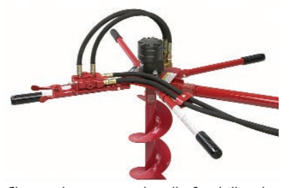
Choose the two-man handle for drilling larger diameter (10"-16") or extra deep holes. It features a standard 150 RPM motor. Faster (220 RPM) and slower (125 RPM) motors are available as options when hole digging requires greater drilling speed or added torque.