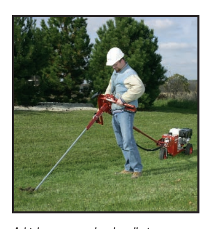
A high-torque anchor handle is designed for anchoring mobile homes or light utility work. At 60 RPM, the standard anchor handle generates 360 ft. lbs. of torque. Optional 125 and 150 RPM motors are also available and are ideally suited for driving bucket augers when performing foundation repair work.